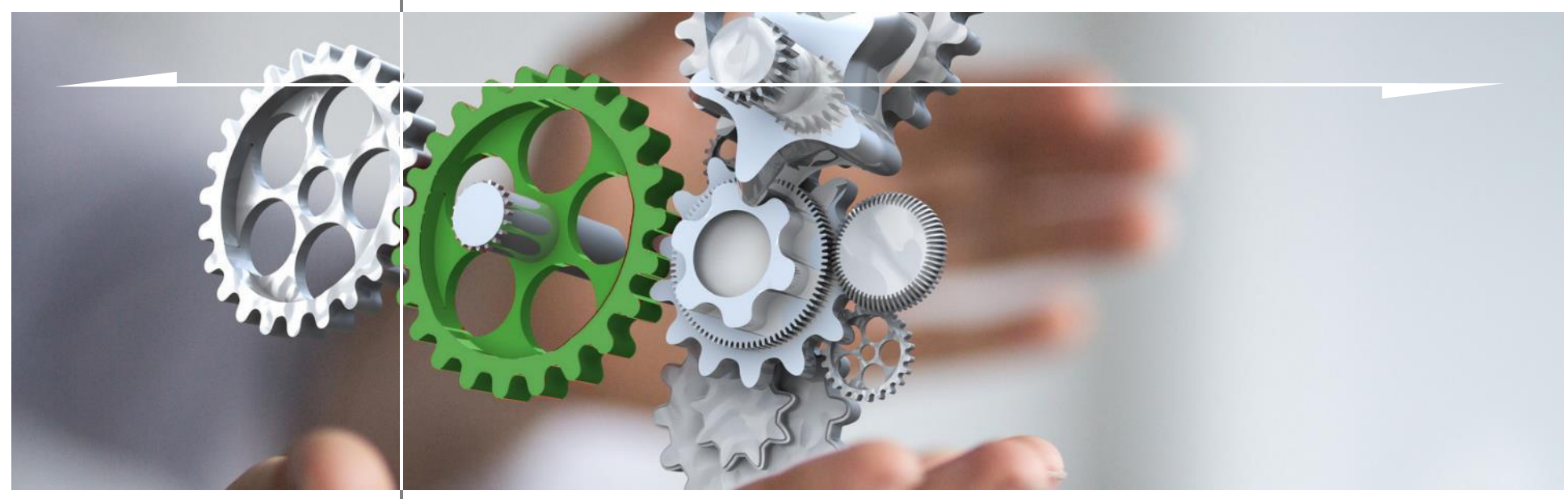
OUR POTENTIAL = YOUR LOGISTICS